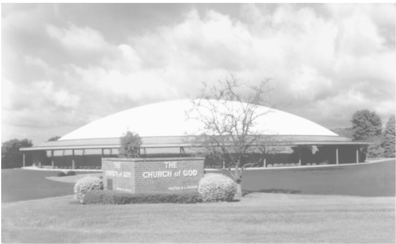
Church of God Tabernacle in Newark, Ohio

"I was glad when they said unto me, Let us go into the house of the Lord."