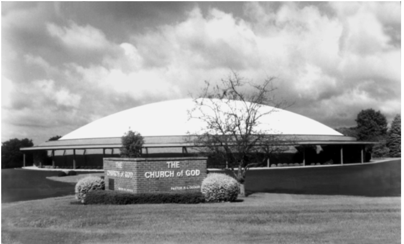
Church of God Tabernacle in Newark, Ohio

"I was glad when they said unto me, Let us go into the house of the Lord."