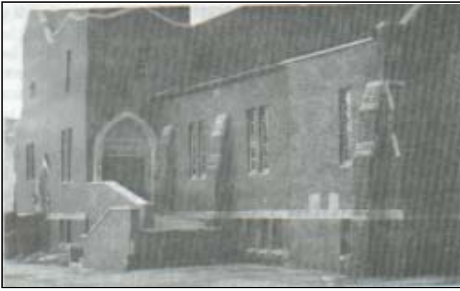
The old church building located at the corner of Sixth and Locust Streets. We used this building to print The Gospel Trumpeter from January 1974 to April 1988.