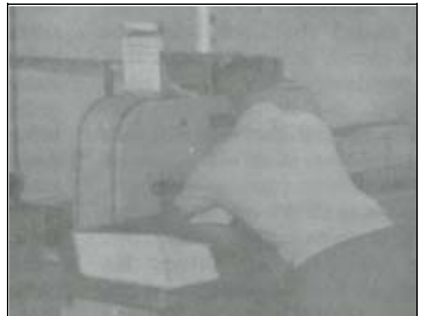
Bro. Don Morris (printer) using the paper cutting machine.