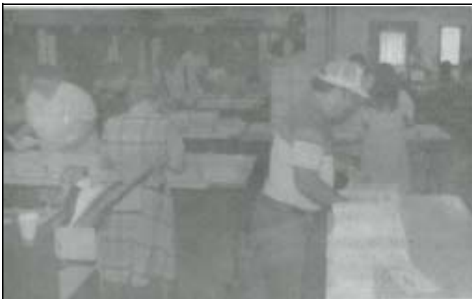
Workers collating the paper at God's Acres in the building pictured above.