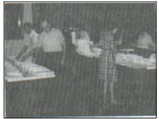
Workers collating the paper in the building on the left.