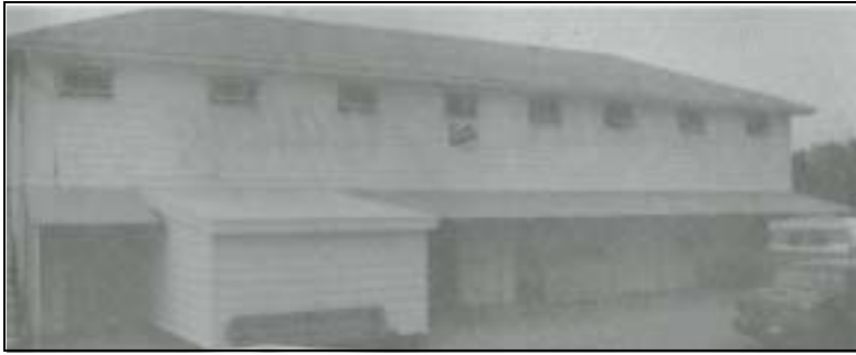
The building above (located at God's Acres) is presently used to print the paper.