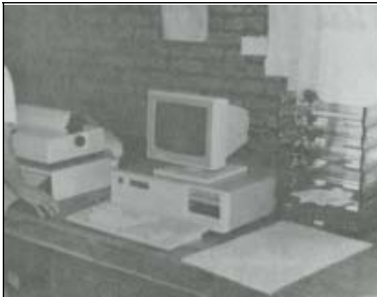
Printer and computer used for mailing, mailing labels, cassette labels, and to type articles for the paper.