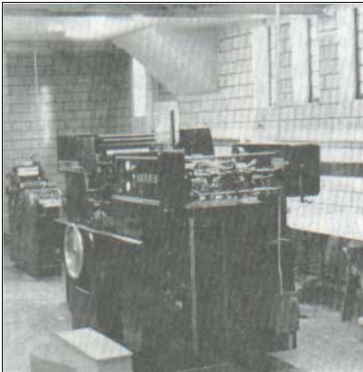
Small and large printing presses. The large press is used to print The Gospel Trumpeter .