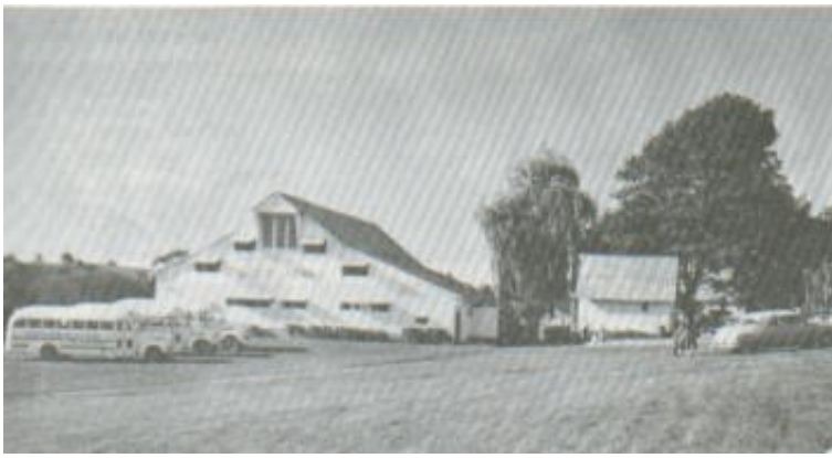
In June 1955, God's Acres was set apart and dedicated to God.