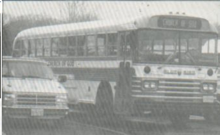
The bus and a large procession of cars leave the church for the cemetery