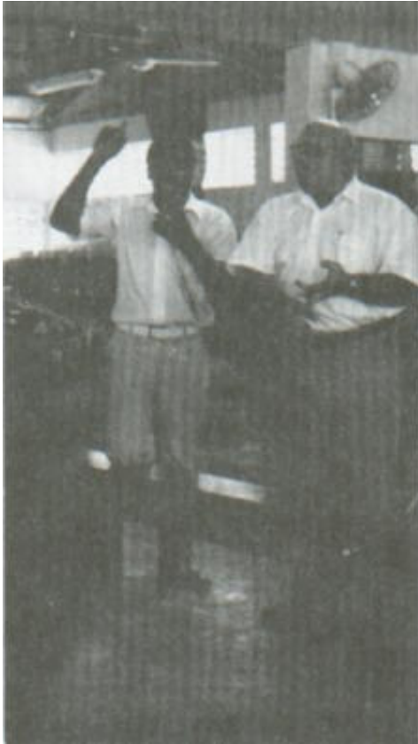
Preaching in Haiti, his burden for foreign missions reached out all over the world in Cuba, Cayman Islands, Philippines, Africa and India.