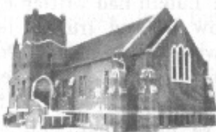
THE GOSPEL TRUMPETER SIXTH & LOCUST ST. NEWARK, OHIO 43055

THE COSTS OF THIS WORK CONTINUE TO RISE. YOUR SUPPORT IN PRAYER AND FINANCE ARE ALWAYS APPRECIATED. – EDITOR